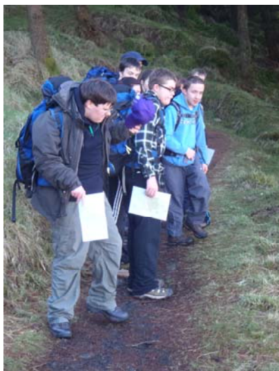
Roddensvale School DOE Bronze participants