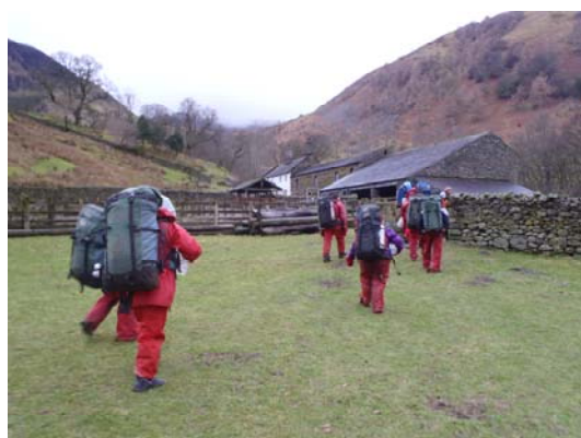
Overnight camping expedition