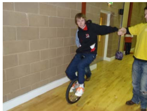
Mastering the uni-cycle